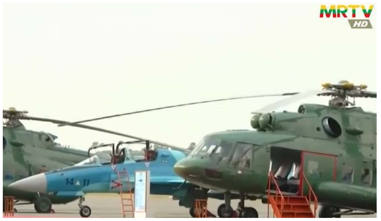
Figure 3: MAF FTC-2000G with tail number 1411.