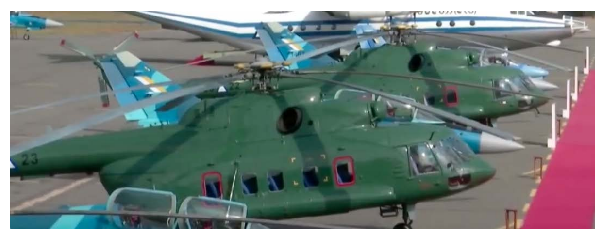
Figure 7: MAF Mi-17MDs in passenger configuration with tail numbers 6623 and 6622.

represent two models, the Mi-17-1V and the Mi-17MDs, and various possible configurations within the MI-17 family (figures 9 and 10).