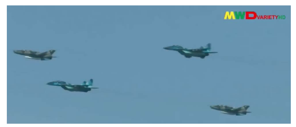
Figure 19: Two F-7s and two MiG-29s (the one in the background is of the UB, two-seater trainer variant).