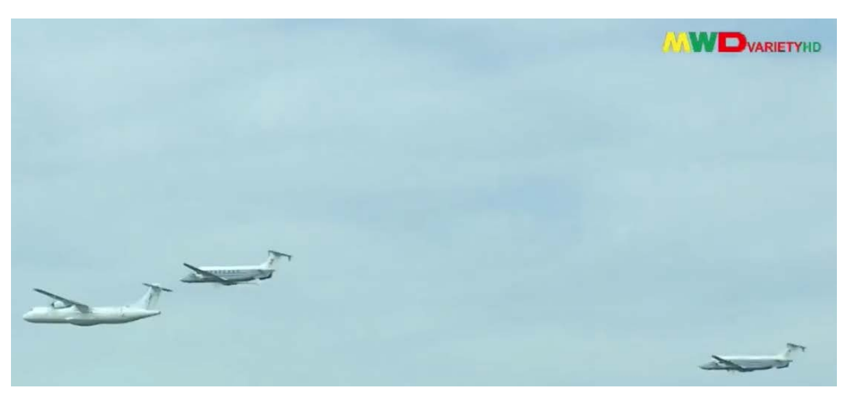
Figure 17: One ATR 72 and two Beechcraft 1900s.