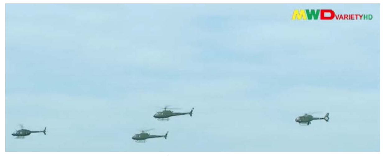
Figure 16: One Bell 206, one EC/H120 and two H-125s. (source: MWD footage).