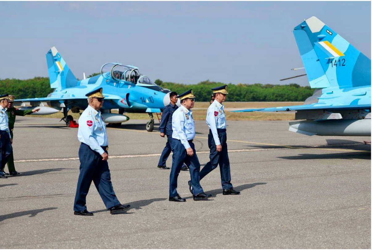
Figure 25: MAF FTC-2000Gs bearing tail numbers 1412, 1410 and a third one too far away to be readable, are lined one behind the other in the previously unoccupied behind the Y-8F-200W.