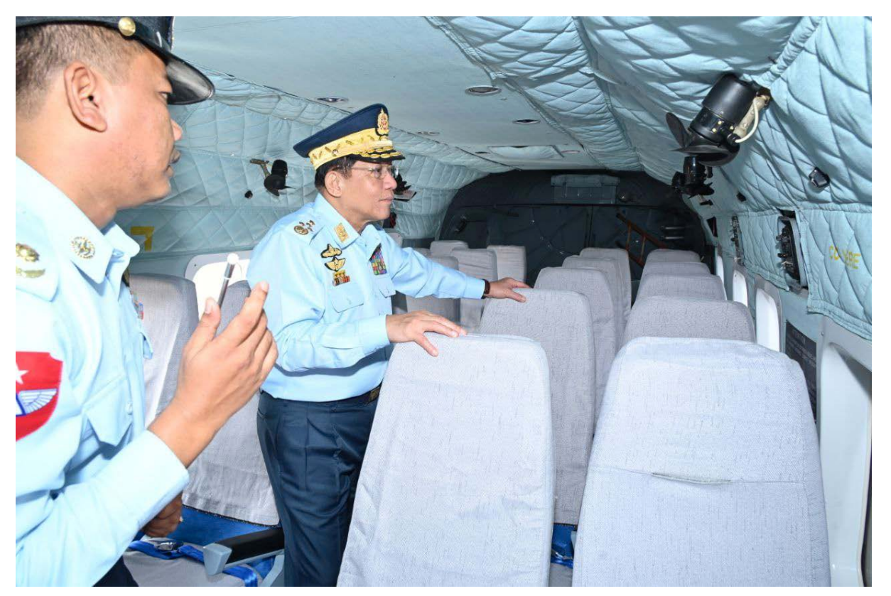
Figure 10: MAF Mi-17MD in passenger configuration with tail number 6622 with close-up of interiors and squared windows. (sources: MRTV footage, Myanmar Transparency News, Office of the Commander-in-Chief of Defence Services).