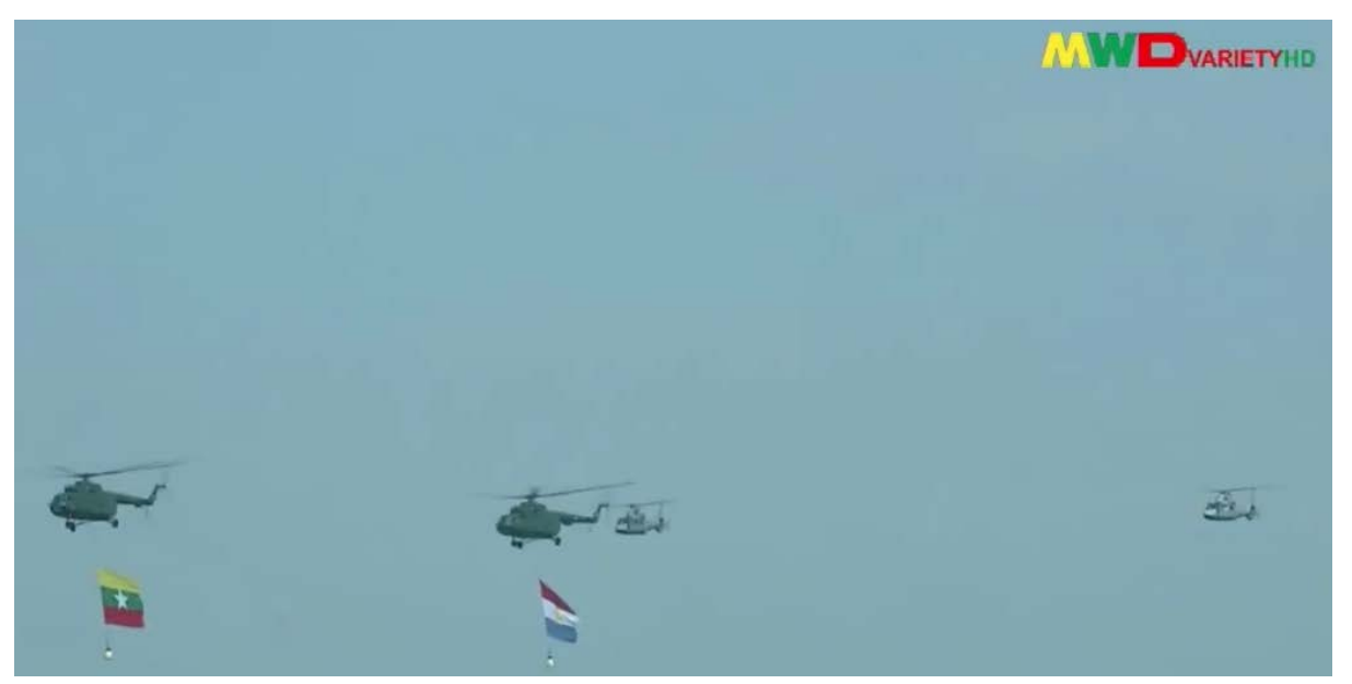
Figure 15: Mi-17-1V tail number 6628 accompanied by another Mi-17-1V and two Myanmar Navy Eurocopter AS365 N2 helicopters..