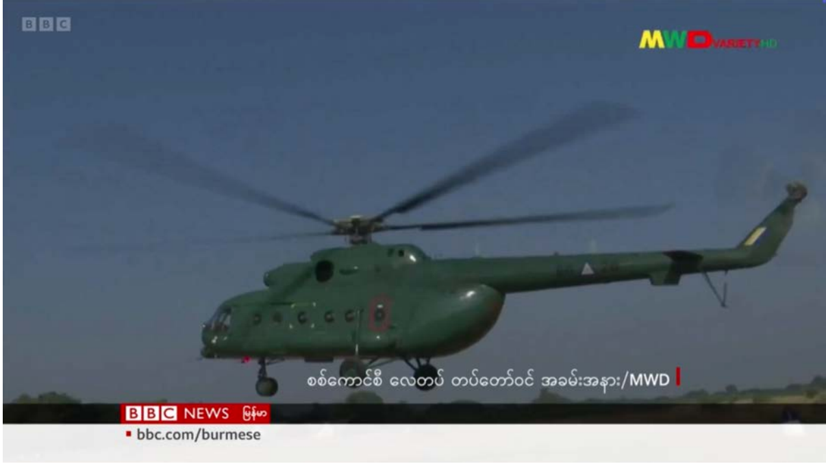
Figure 14: MAF Mi-17-1V bearing tail number 6626 during take-off (sources: MRTV footage and MWD footage employed by BBC Burmese).