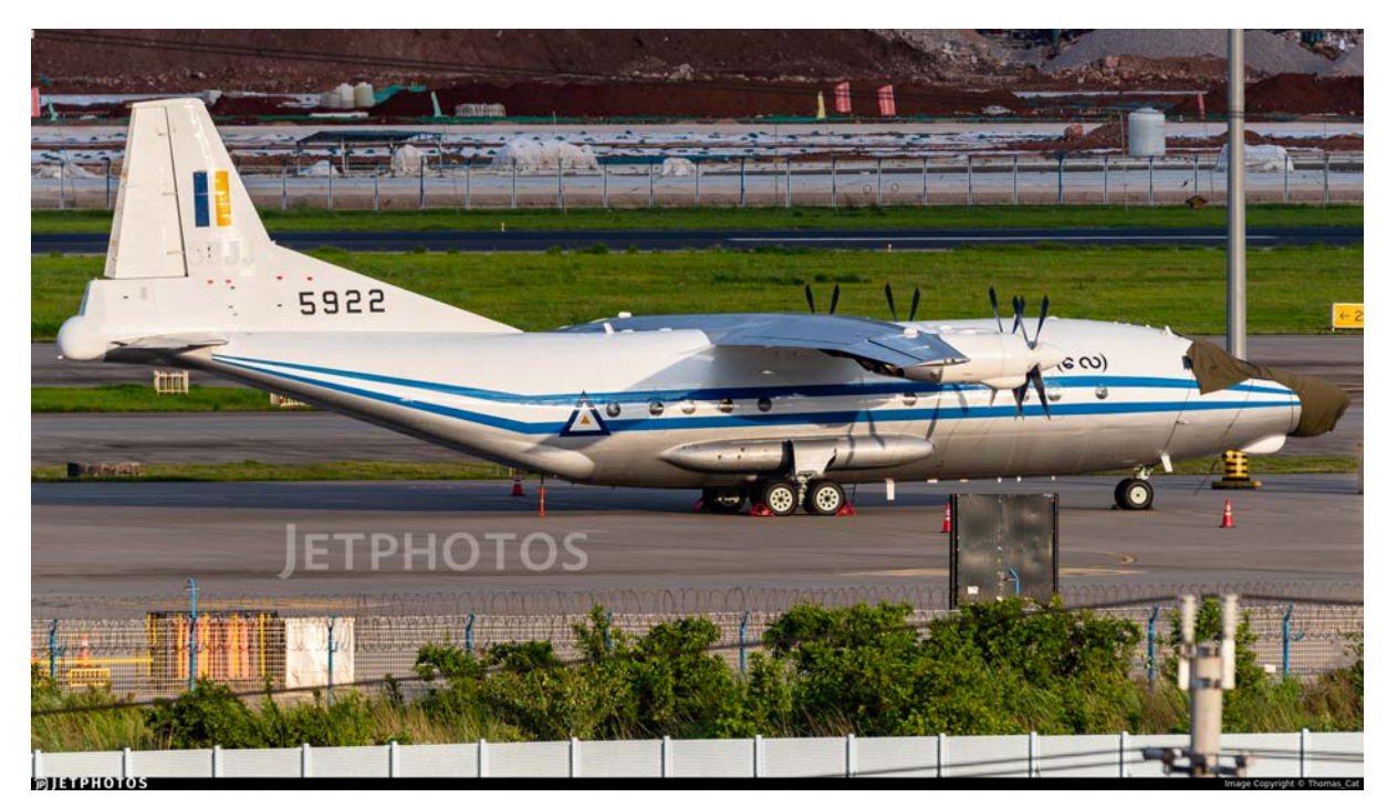
Figure 6: SAIC Y-8F-200W with tail number 5922 at Kunming Changshui International Airport on 7 July 2024. (source: JetPhotos).