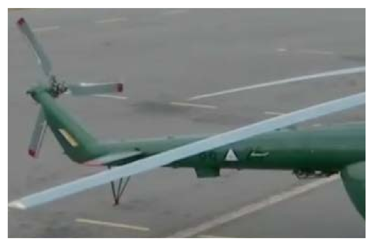
Figure 8: [Top] image is MAF Mi-17-1V with tail numbers 6625 and [Bottom] image is close-up of tail number.