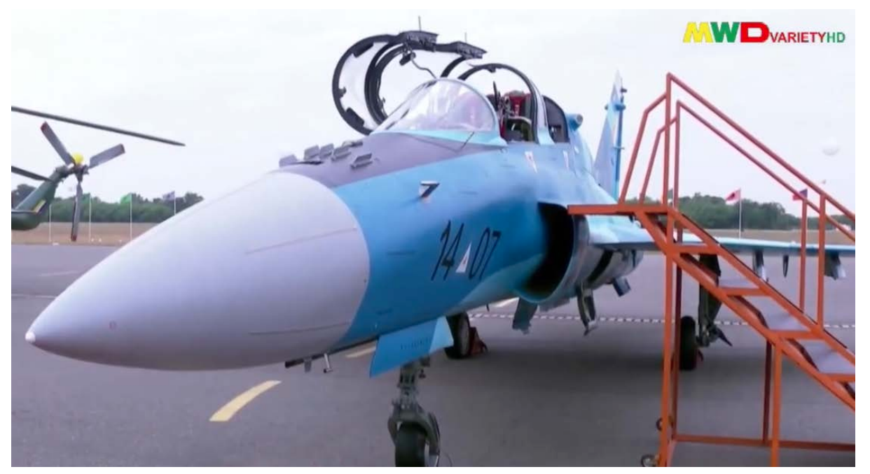
Figure 2: MAF FTC-2000G with tail number 1407. (source: MWD footage).