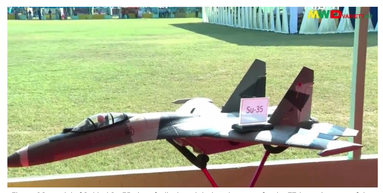
Figure 26: model of Sukhoi Su-35 aircraft displayed during the event for the 77th anniversary of the establishment of the MAF, within the flight school's premises.

Lastly, it is important to note the Sukhoi Su-35 model, which was displayed during the SAC chairman Min Aung Hlaing's visit to the MAF flight school premises (figure 26). While its presence at the ceremony could suggest a potential gift from a previous visit to Russia, it may also indicate future plans for MAF acquisitions. However, there is currently no concrete information that helps confirm any plans to integrate the Su-35 into the MAF service.