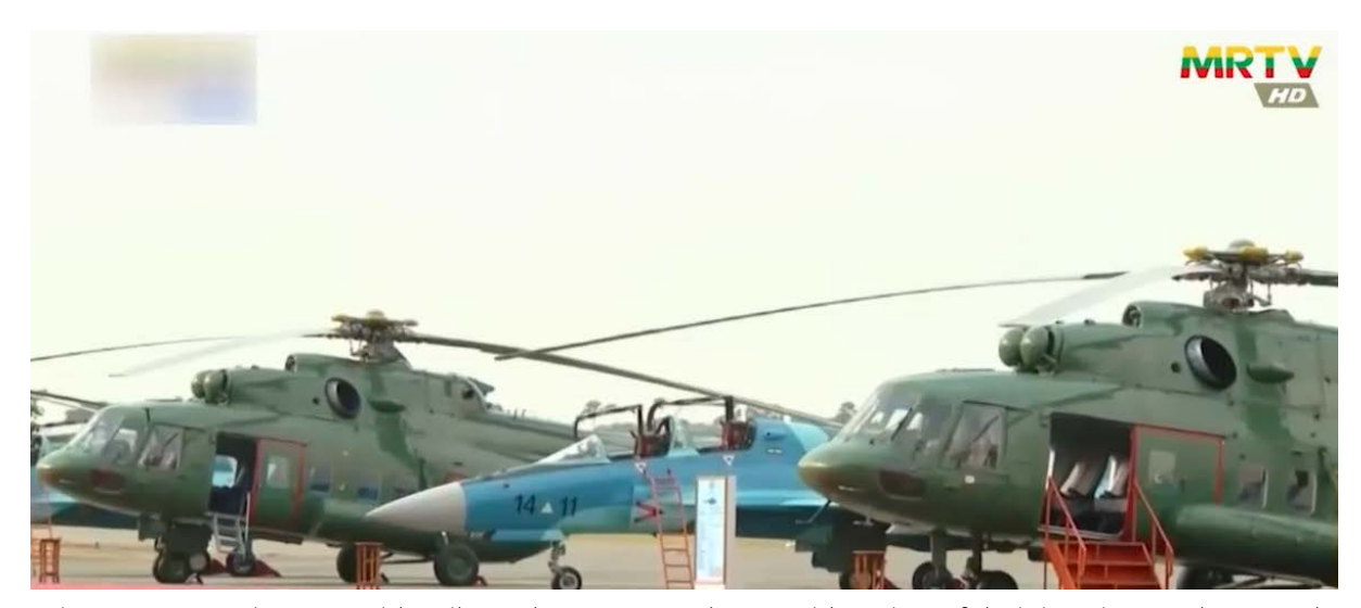
Figure 9: MAF Mi-17MDs with tail numbers 6623 and 6622 with a view of their interiors and squared windows.