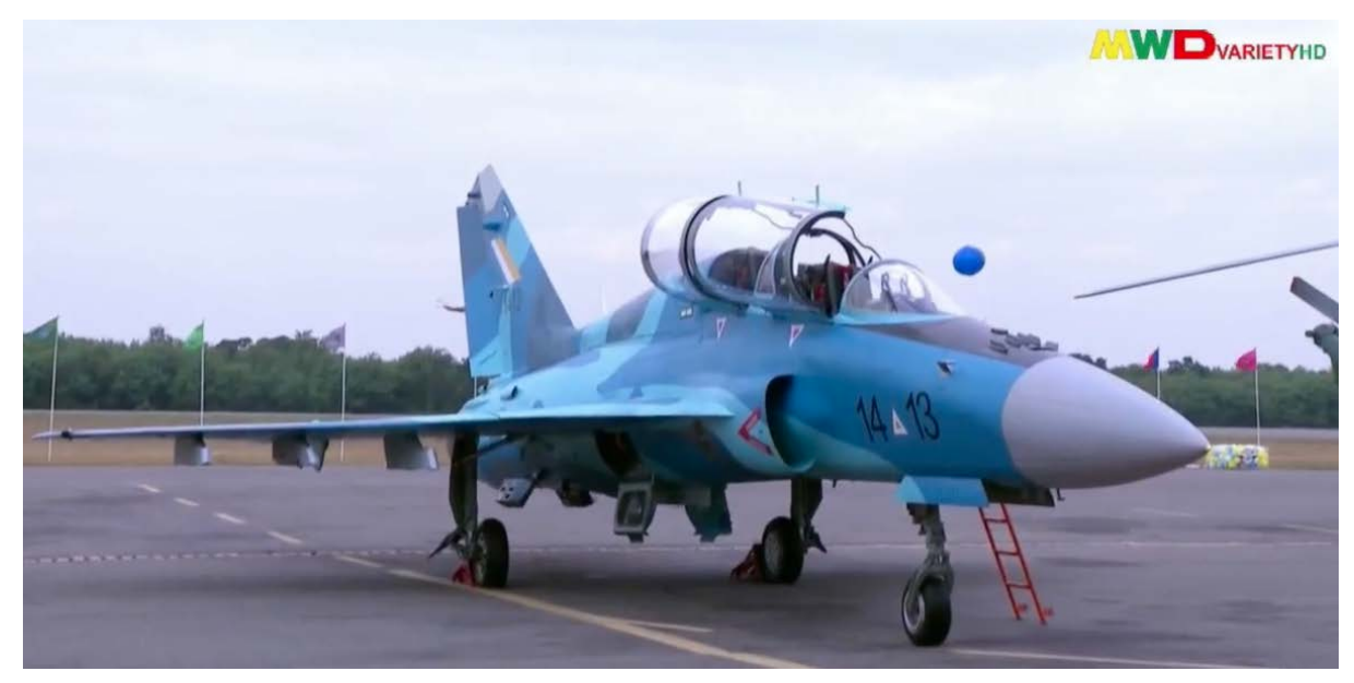
Figure 4: MAF FTC-2000G with tail number 1413.