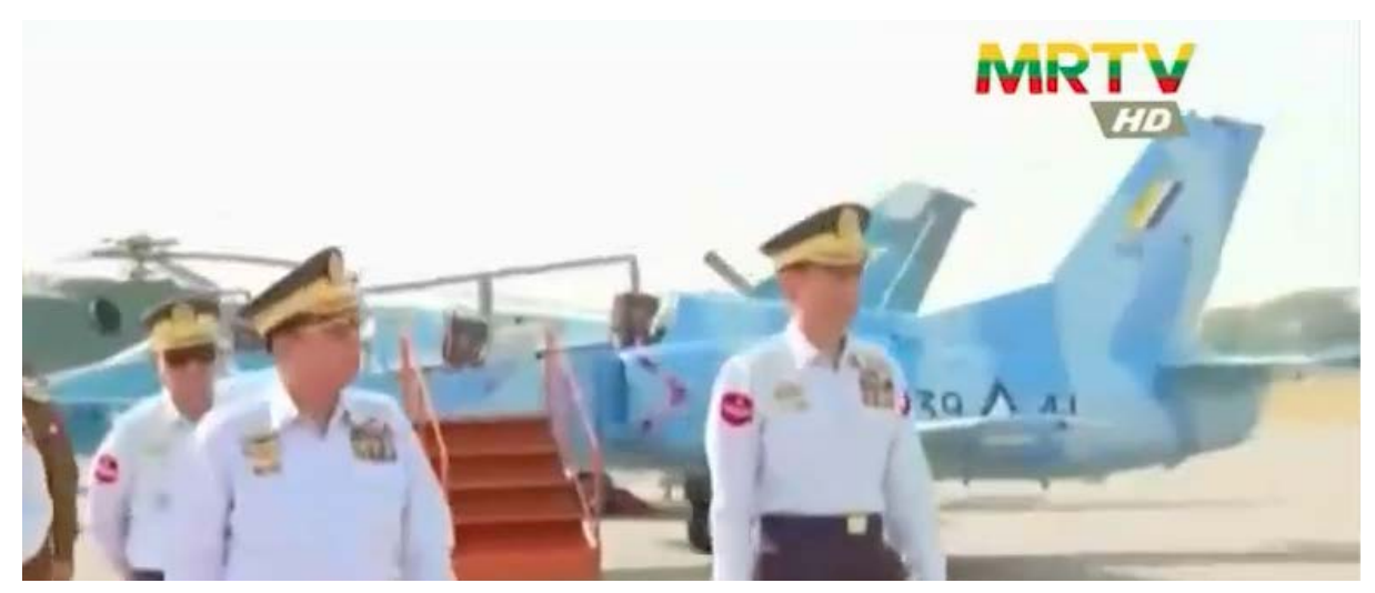
Figure 11: MAF K-8 with tail number 3941. (source: MRTV footage).