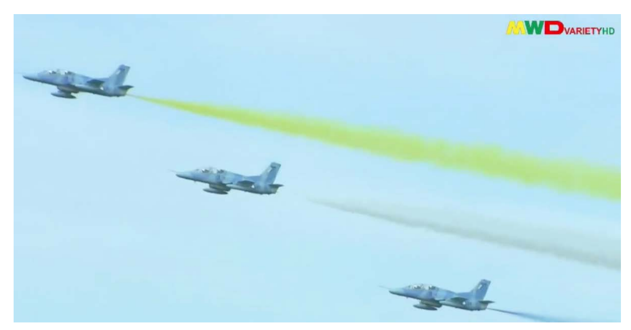
Figure 18: Three K-8 trainer jets, previously spotted on the tarmac: 3930, 3925 and 3926 before the flyby.