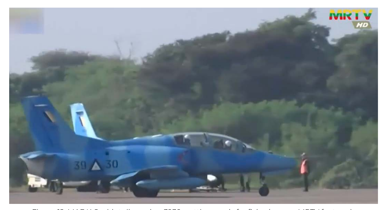
Figure 12: MAF K-8 with tail number 3930, getting ready for flyby. (source: MRTV footage).