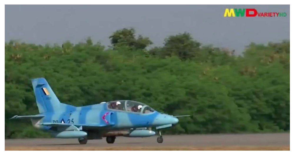
Figure 13: MAF K-8s, bearing tail numbers 3930, 3925 and 3926, getting ready for flyby.