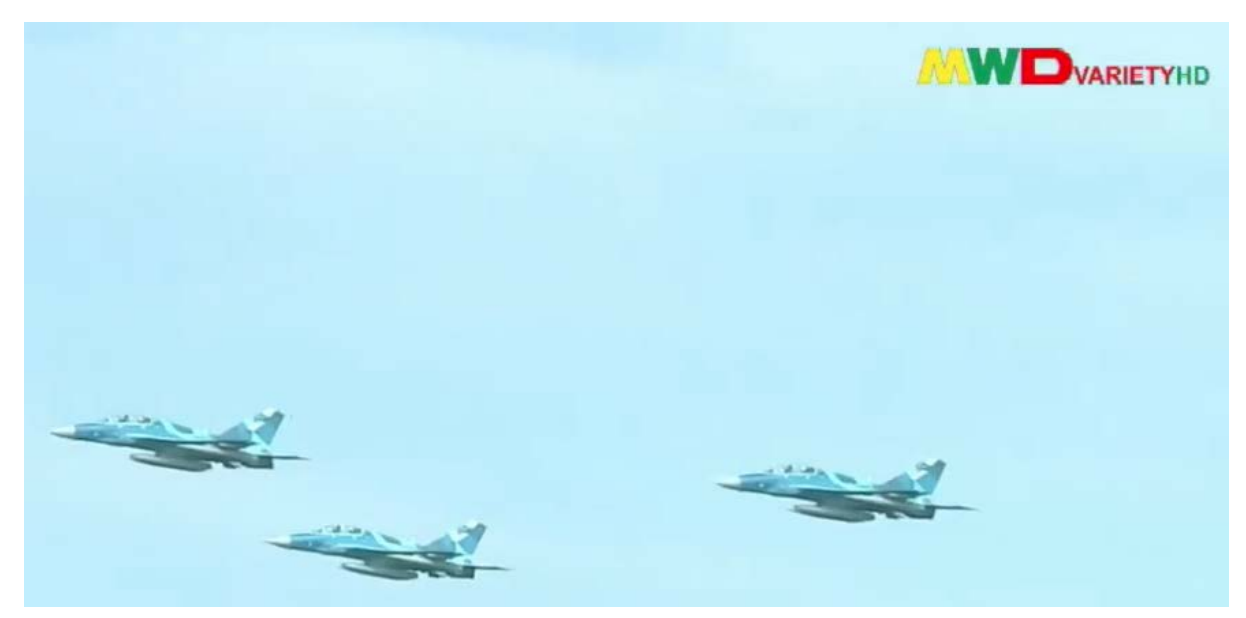
Figure 20: Three FTC-2000Gs. (source: MWD footage).