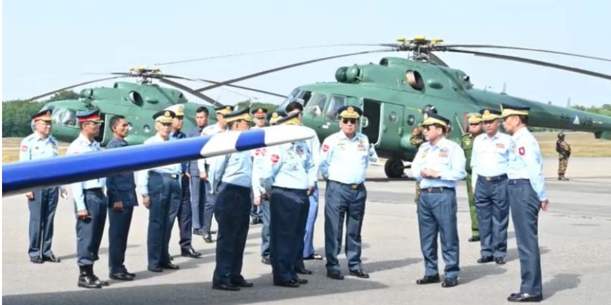
Figure 22: Two MAF Mi-17-Vs, the first bearing tail number 6626. (sources: MWD footage and Office of the Commander-in-Chief of Defence Services).