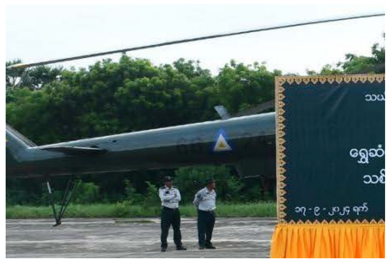
Figure 24: MAF Mi-17-1V bearing tail number 6624 showcased at a government campaign in September 2024. (source: Ministry of Interior - Information and Public Relations Department).