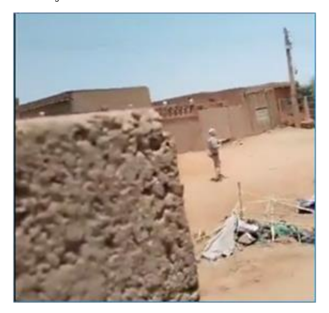
Figure 5: RSF soldiers shooting at civilians in Haj Yousef. Location unknown.

residents, one soldier brandishes his rifle and begins to shoot in the general direction of the residents. A women close to the camera's point of view is heard saying 'Khishu' which translates to 'get inside'.