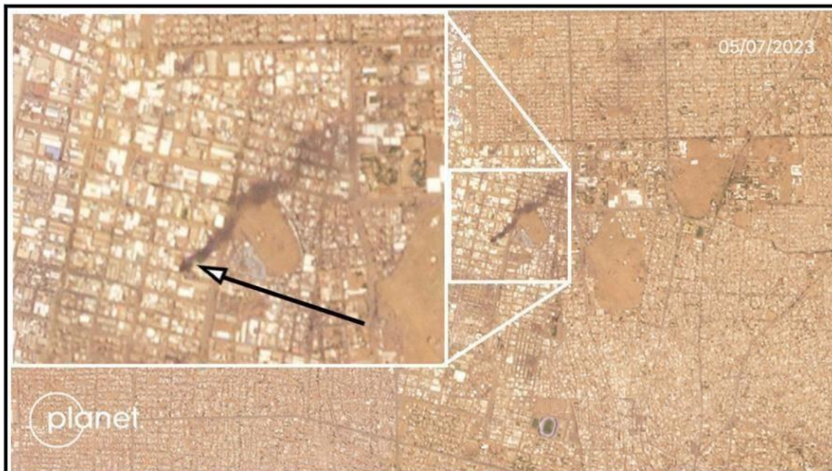
Figure 2: PlanetLabs satellite imagery of the Central area of Omdurman on 5 July 2023 [15.66148,32.466817]

On 3 July 2023, a drone operator based in Khartoum picked up a large smoke plume from a fire coming from West Al-Thawrat, an industrial area just north of the Central Omdurman Market (Figure 3). Using NASAFIRMS data and Google Earth, CIR verified the location and date of the footage (Figure 4). Reports on social media varied on the function of the facility, the most common claim was that it was a plastic materials products factory.