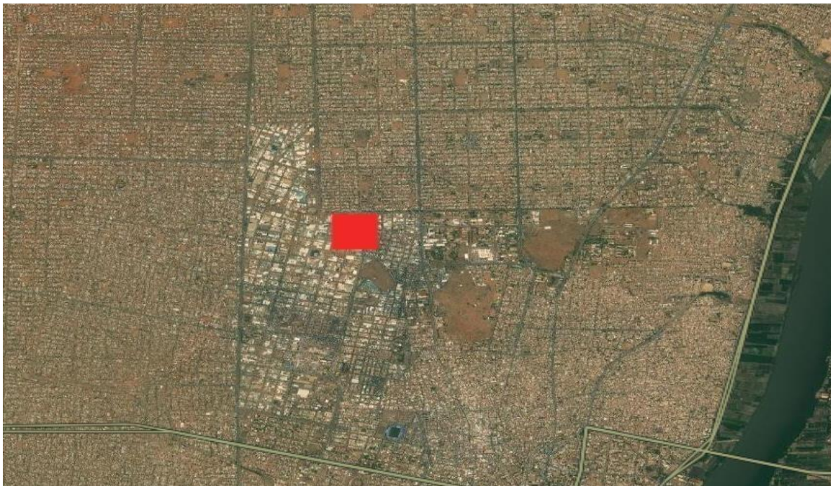
Figure 4: NASAFIRMS imagery showing an anomaly over the site of the fire in Omdurman Industrial district.