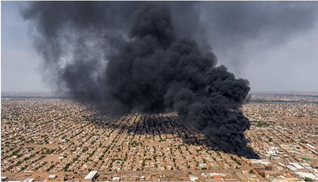
Figure 3: Drone footage showing a large fire in Omdurman Industrial district [15.675302,32.461024]