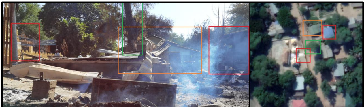
Figure 8: Images (graphic) uploaded to social media showing destruction to Let Pan Kyun Lay village and associated geolocation by Myanmar Witness.

Another image uploaded by the same social media user was also geolocated by Myanmar Witness to Let Pan Kyun Lay village. In the following verification, the place of worship was a key identifier, together with another UGC video, that had some of the features in the image seen from different angles (source redacted due to privacy concerns).