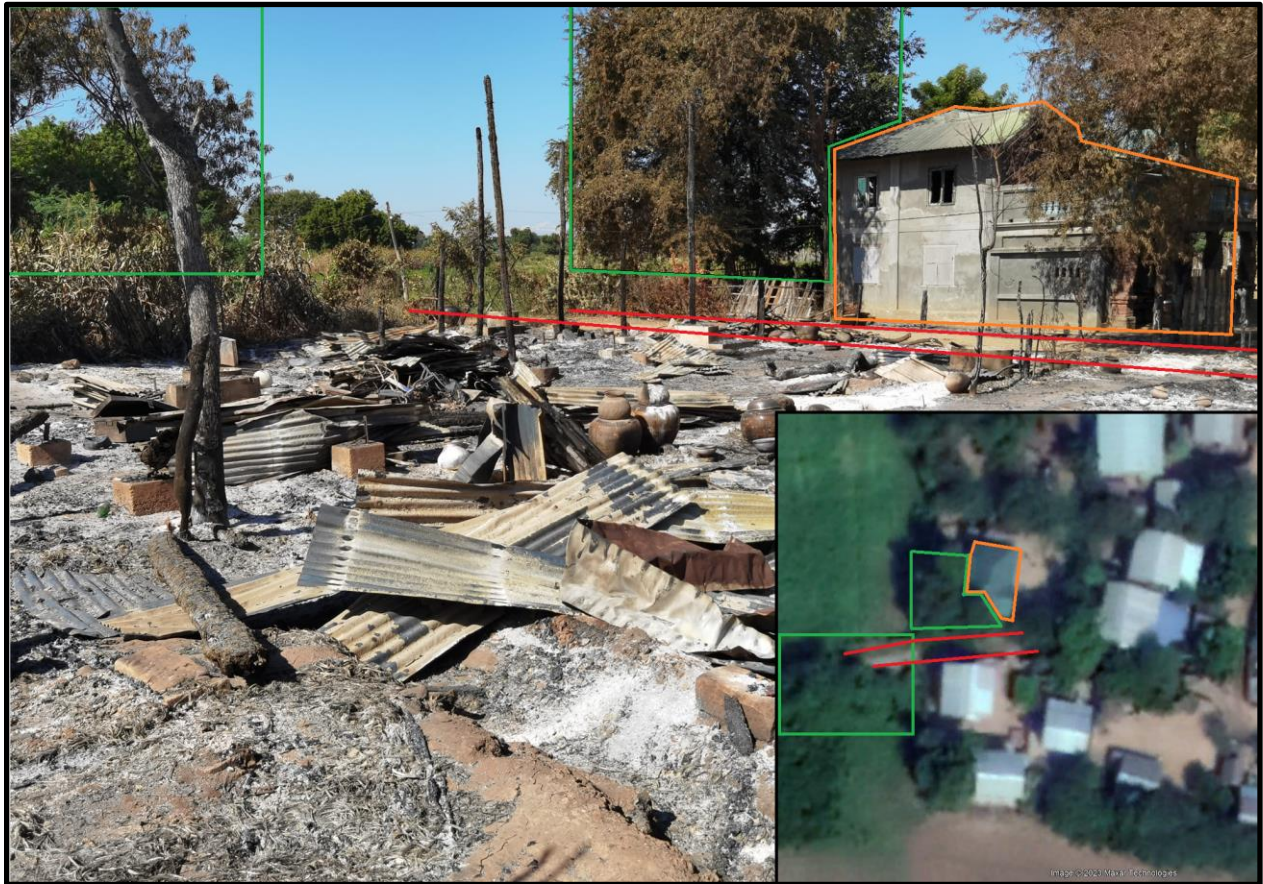
Figure 7: Images (graphic) uploaded to social media showing destruction to Let Pan Kyun Lay village and associated geolocation by Myanmar Witness.

town. Myanmar Witness was able to geolocate the image below , which was uploaded to social media, using the orientation of the roofs, the road, and the flora.