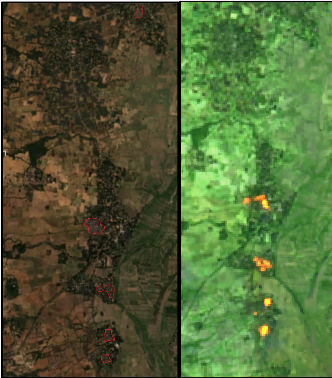
Figure 2: Sentinel satellite imagery. [Left] Visible damage to villages. [Right] False colour version using Thermal IR spectra (Short Wave InfraRed).

The locations of fires identified using FIRMS were then further analysed using Sentinel satellite imagery. The areas were visibly damaged, corroborating the FIRMS data. Figure 2 shows the locations of the fires, marked in red. The land is discoloured compared to surrounding areas, indicating burn marks. A false coloured version of the same imagery (Figure 2, right) which uses Thermal IR spectra (Short Wave InfraRed) starkly shows the fire sites.