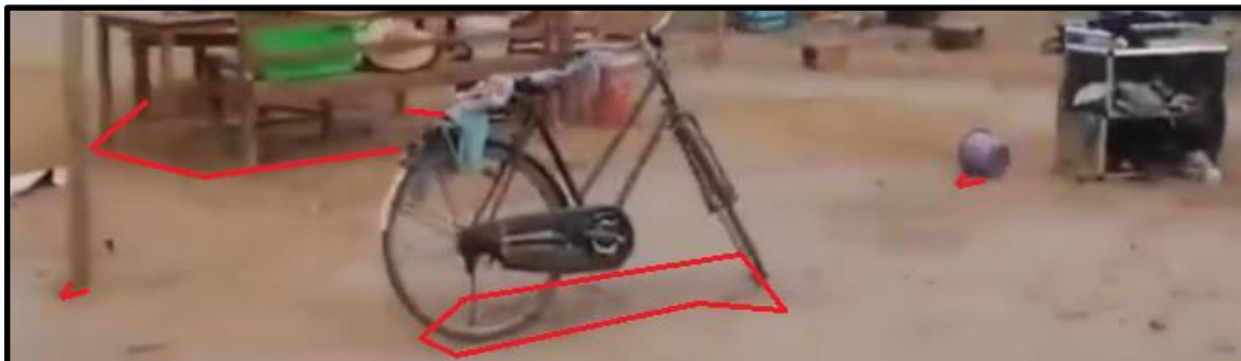
Figure 6: A still frame taken from the video showing a slight westerly shadow which can be used to identify a rough time frame within which the video was filmed.

As is visible within the video, there is a slight shadow towards the west, indicating that the video was likely filmed before noon. However, the smoke, fires and possible cloud coverage do decrease the clarity of the shadow, limiting Myanmar Witness' ability to precisely chronolocate the footage.