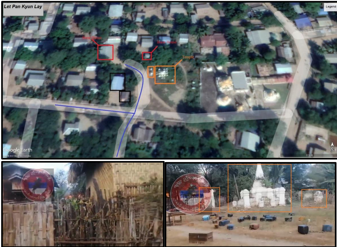
Figure 5: Geolocation of the video by Myanmar Witness which confirms that the fire took place in Let Pan Kyun Lay village.

As is visible within the video, there is a slight shadow towards the west, indicating that the video was likely filmed before noon. However, the smoke, fires and possible cloud coverage do decrease the clarity of the shadow, limiting Myanmar Witness' ability to precisely chronolocate the footage.