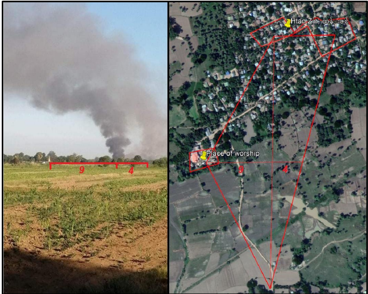
Figure 4: [Left] User-generated content posted on social media and analysed by Myanmar Witness. [Right] Geolocation carried out by Myanmar Witness in order to confirm the location of the fire.