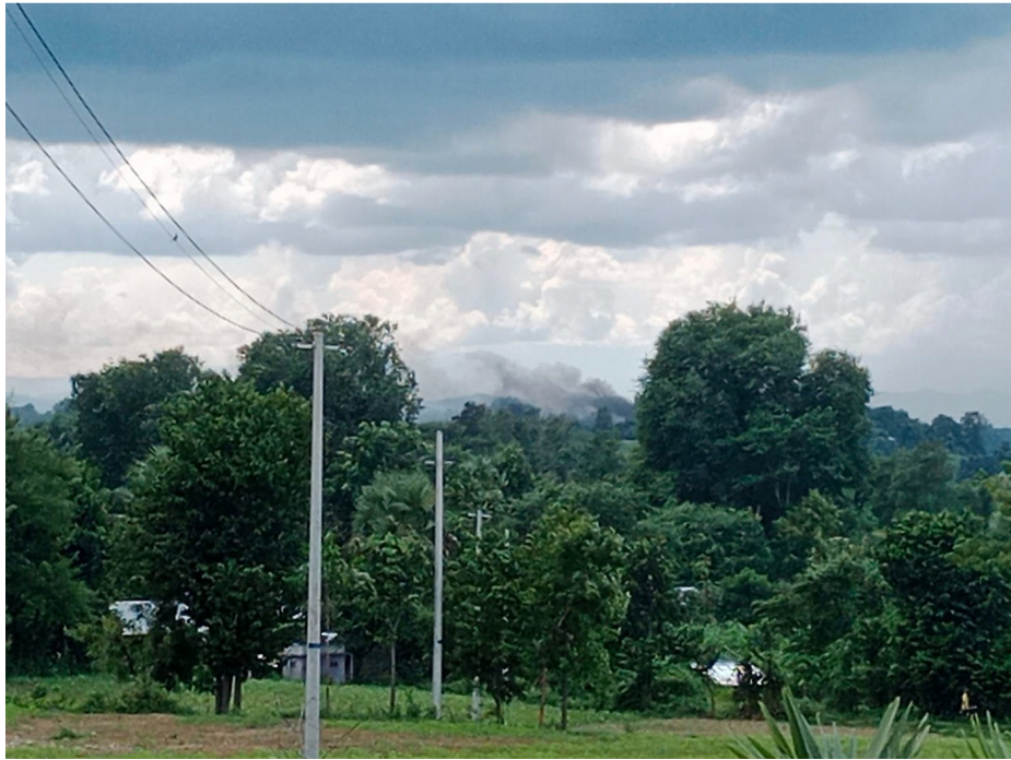
Figure 2: Claims to show fire in the direction of Taung Myint (တောင်မြင့်ရွာ) village. Myanmar Witness analysts believe this footage was taken from 21.401250, 94.486905 looking west, but have not yet fully verified it.

Additionally, Myanmar Witness geolocated footage taken on 16 October of the burnt school. The geolocation of the destroyed buildings in this footage matches the coordinates for the school.