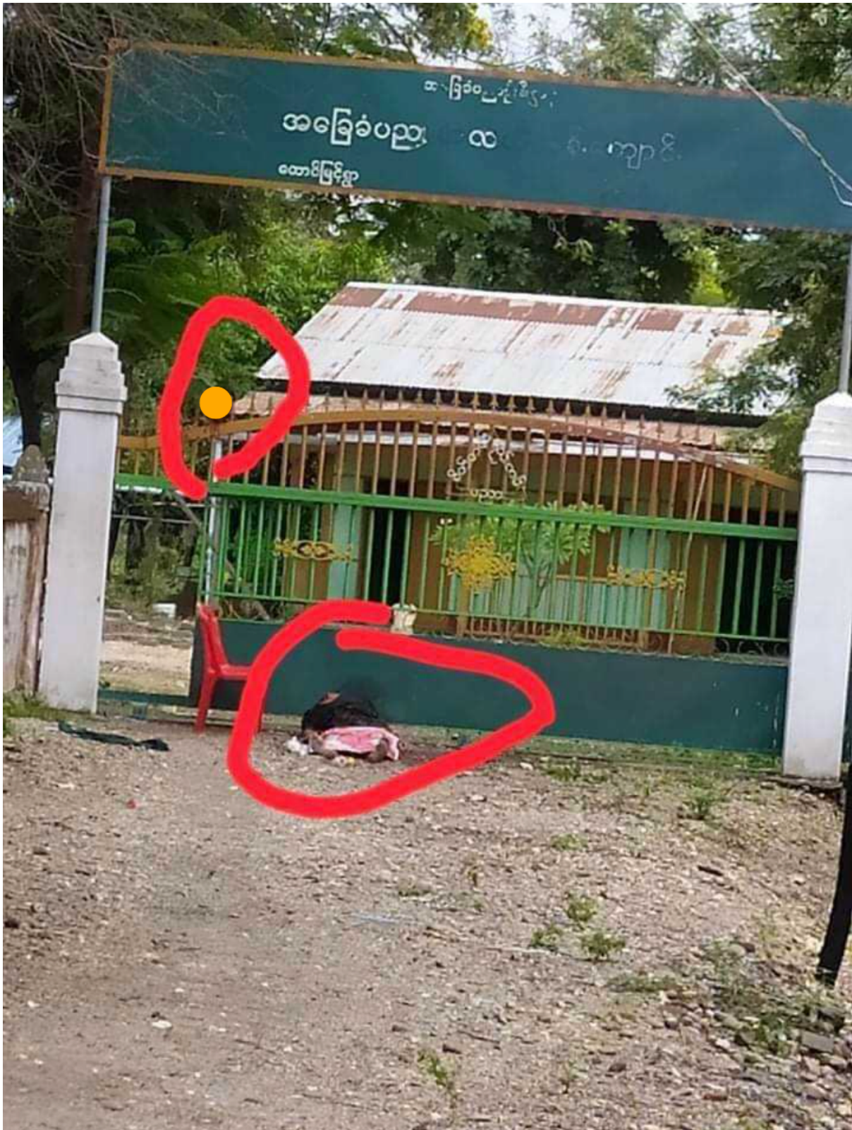
Figure 6: Head on the school gates of Basic Education Middle School of Taung Myint Village.