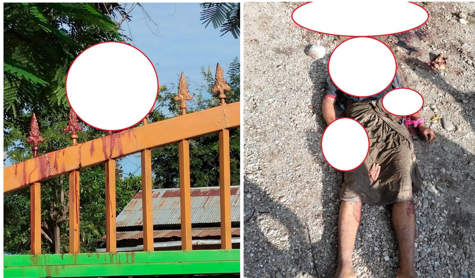
Figure 5: Head of an individual, separated from his body, is left on the gates of the school.