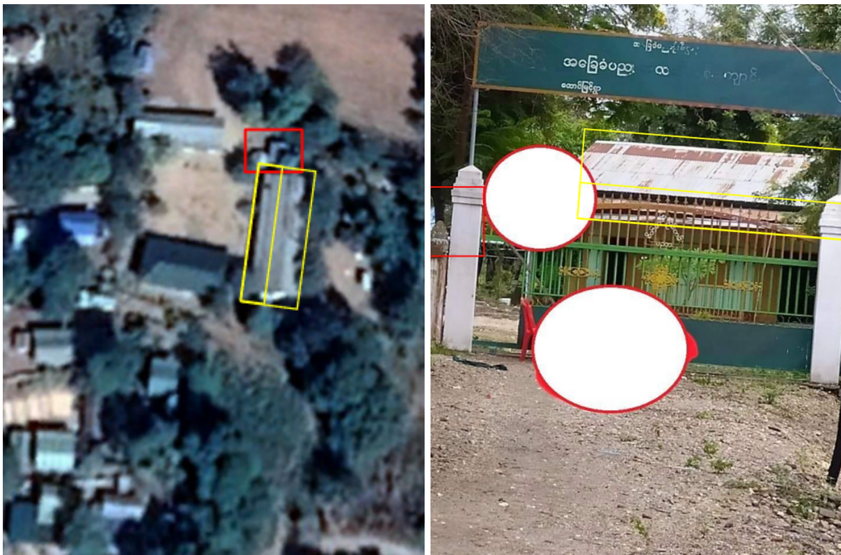
Figure 1: Geolocation of the CDM teacher's body and head at Basic Education Middle School of Taung Myint (တောင်မြင့်ရွာ) village.

Coordinates of school: 21.400753, 94.479275