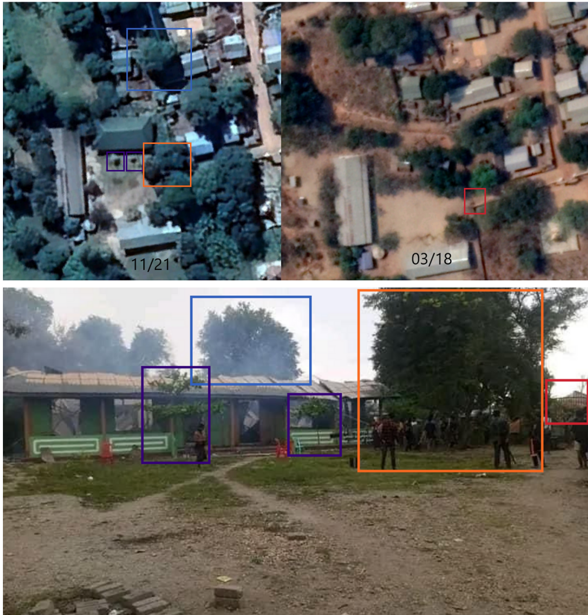
Figure 7: Geolocation of graffiti on the wall to the same school.