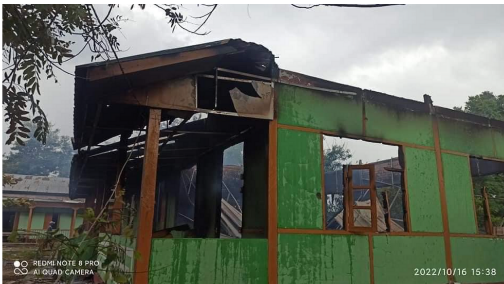
Figure 3: Images of a burnt green building show the geolocated school in the background.

Additionally, Myanmar Witness geolocated footage taken on 16 October of the burnt school. The geolocation of the destroyed buildings in this footage matches the coordinates for the school.